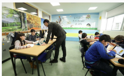
Classrooms and school