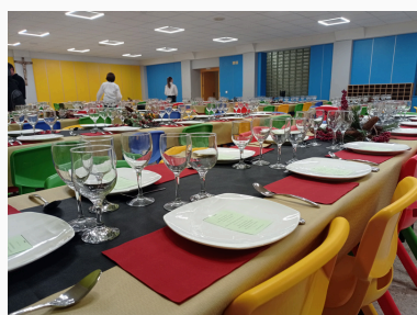
School canteen and boarding school