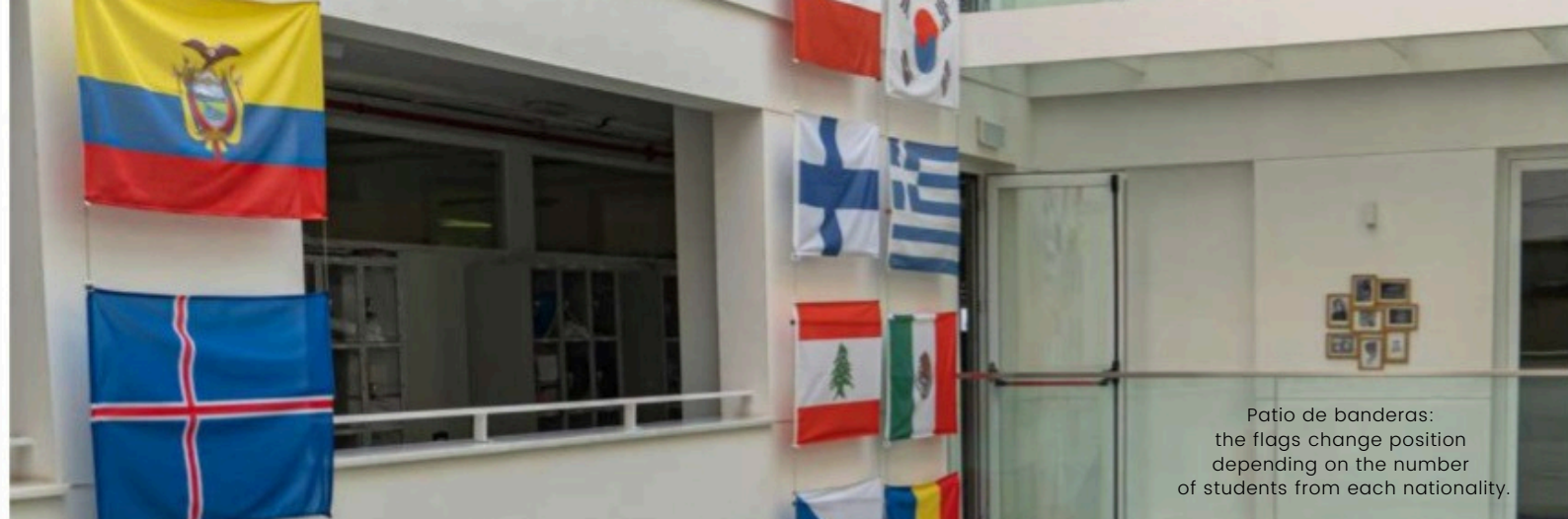
Patio de banderas: the flags change position depending on the number of students from each nationality.