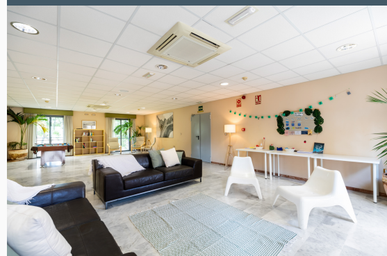
Common room in the boarding school

In just one hour by train, students can reach the vibrant city of Cádiz. The nearest beach is just 20 minutes by car!