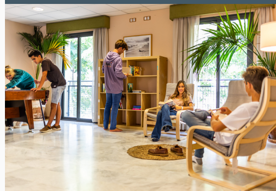
Common room in the boarding school

The workshops included complement a very high-quality British Curriculum!