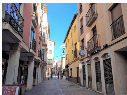
Aranda de Duero

What sets the school apart is the personalized treatment of students.