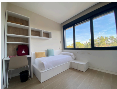
Double-room with en-suite bathroom